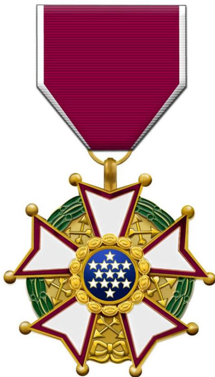
Legion of Merit (Degree of Legionnaire)